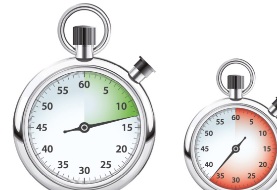
Agility® 12:55 min